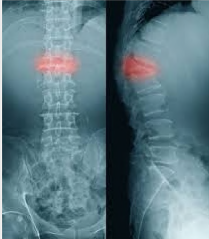
Compression Fracture L1